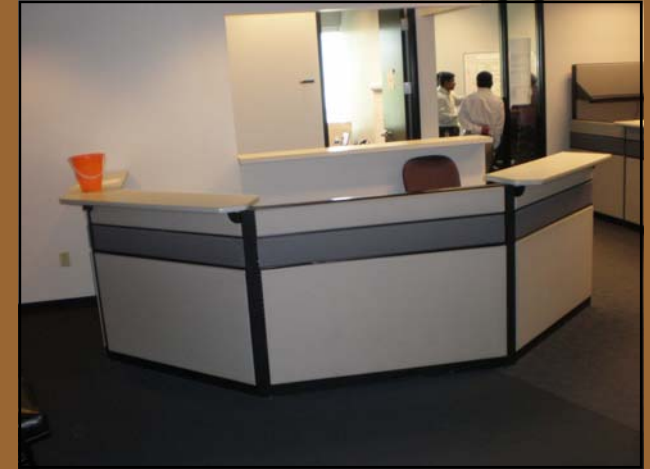
◆ Secondary Reception Area