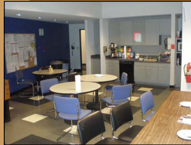
◆ Large Break Room