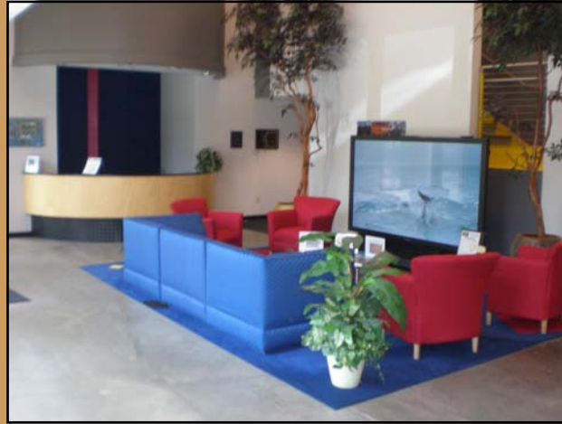
◆ Shared Lobby with Private Elevator