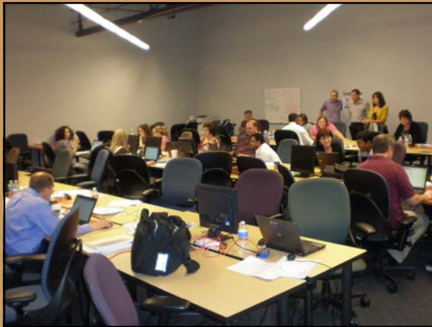
◆ Large Call Center Capabilities