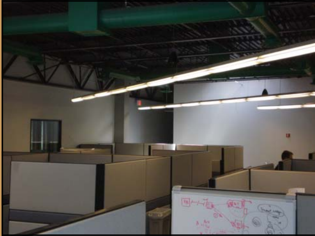
◆ Modular Furniture

4323 E. Cotton Center Blvd. Phoenix, Arizona